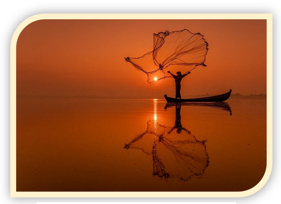
Nikon D850 and 14-24mm, F/8@1/2000 sec. 320 ISO

Whenever I traveled in the beginning, I was always more comfortable going down 'unfamiliar roads' which often meant avoiding big cities and choosing small country towns and villages. I found it was much easier to meet people and thus find people subjects as they were more trusting, plus it promised me that I would be shooting potentially NEW material that had not seen before versus going to the more familiar locations such as New York and spending my time shooting subjects like the FAMILIAR skyline or the Empire State Building or